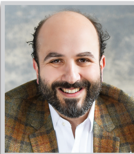
HARO SETIAN 2016 Closed Production: 406 Units $78 Million Volume