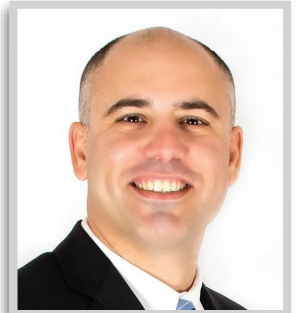
ZOHAR AMIR 2016 Closed Production: 127 Units $78 Million Volume