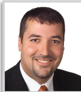
MATT PERRY 2016 Closed Production: 204 Units $60 Million Volume